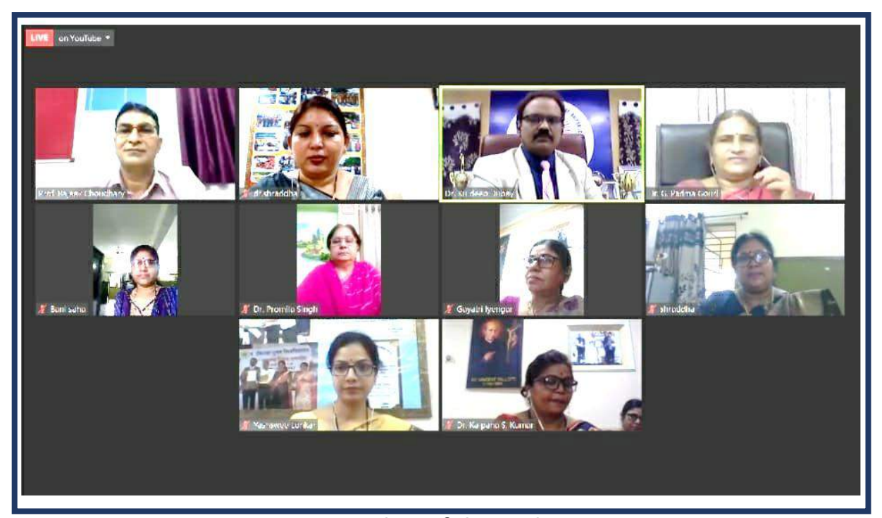
Screen-shot of the Webinar