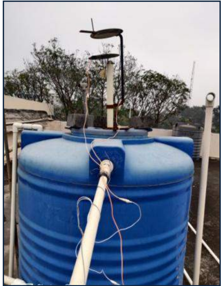
SENSOR BASED ENERGY CONSERVATION II