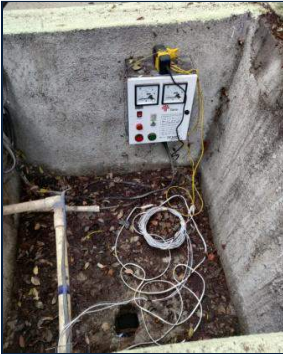
SENSOR BASED ENERGY CONSERVATION I